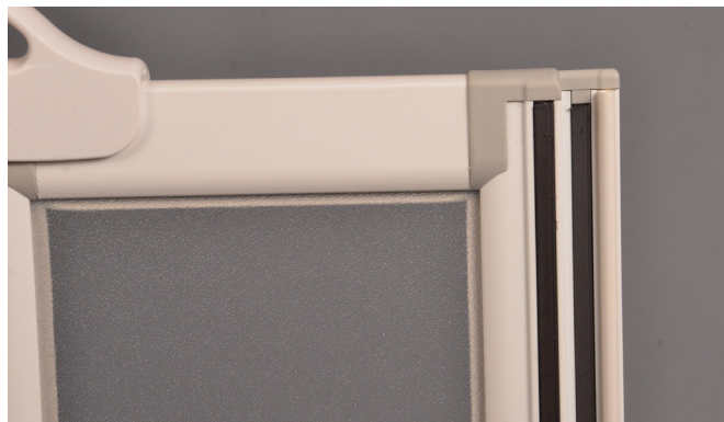
The "free edge" of each door pair has two magnetic strips that seal the overlap connection when the door is closed.